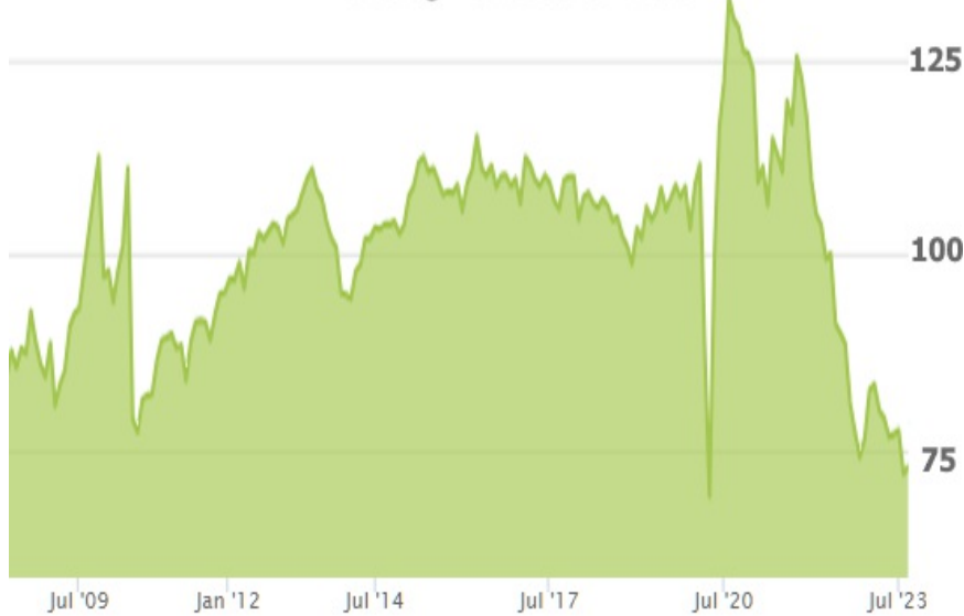
Pending Home Sales Index

Both charts convey post-covid volatility, but one says the housing market is stable and improving while the other says it's as bad as it's been in decades. How can two reports on home sales tell such different stories?