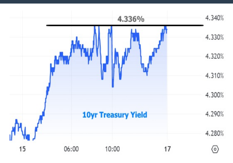
4.34% is where the 10yr ended on August 21st. It remains the highest daily closing level since 2007 so repeated flirtation is important. When a bond yield (or any other financial market security, for that matter) exhibits this bouncy behavior around a previous extreme, it becomes known as a "technical level" by a large portion of the trading community.

Technical levels go by many names (key level, pivot point, inflection point, or simply "ceiling"). A technical level can be a ceiling if it acts like a ceiling, but it can be an inflection point if it is subsequently broken.