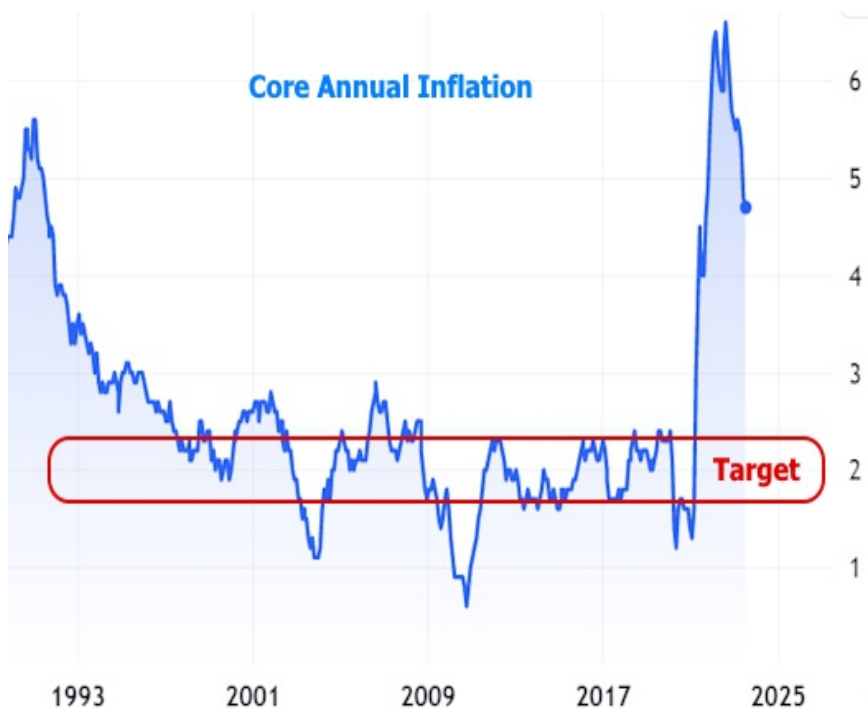
Core Annual Inflation

It's also worth noting that the Fed is well aware of the progress, but their inflation targets are expressed in ANNUAL terms. They would point out that our observation above about inflation being at levels consistent with "just right" is only true if nothing changes over the next 9-10 months. As of today, annual inflation is still way too high.