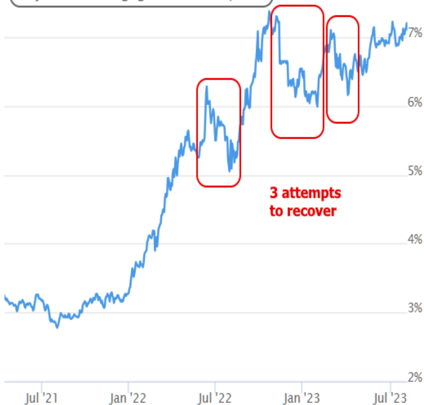
30yr Fixed Mortgage Rate Index, MND

Is there any hope for relief? There's always hope. The only question is one of timing. Timing will depend on economic data and inflation, among other things. Markets got a glimpse of just that sort of relief on Friday following the big jobs report from the Labor Department. It was still very strong in a historical context, but not quite as strong as economists had predicted.