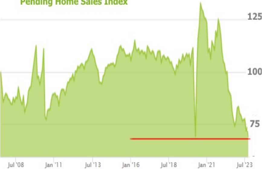
Pending Home Sales Index