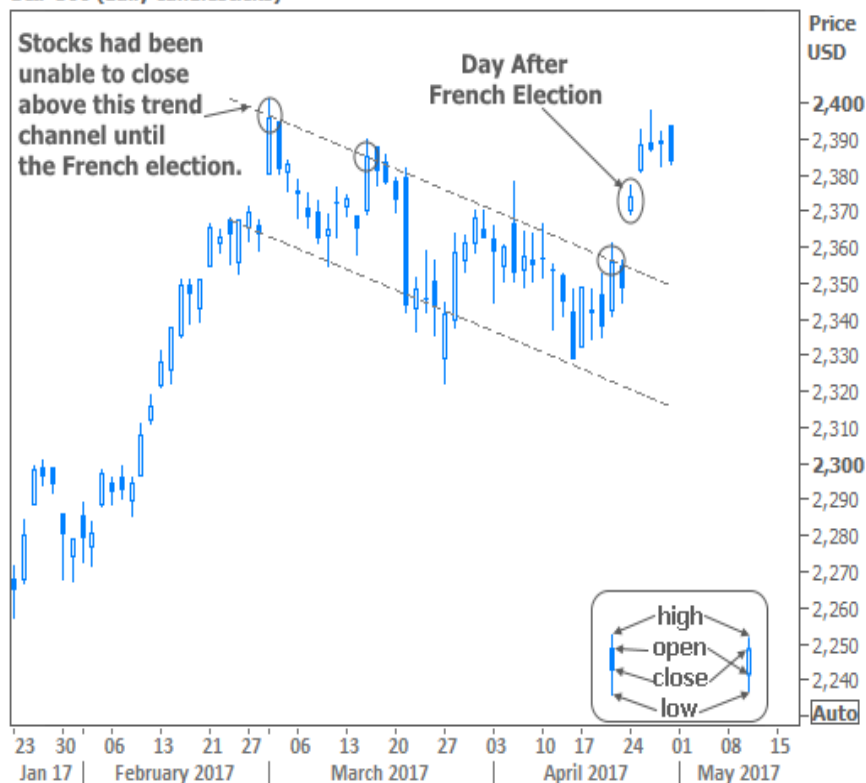
S&amp;P 500 (daily candlesticks)

We might take the stock breakout with a grain of salt for a few reasons. First of all, it's earnings season, which often provides some extra levity. From a technical perspective, the S&P (the index of choice among traders) was unable to break above March 1st's all-time highs. If that ceiling remains intact, stock traders will increasingly think about checking out the lower side of the range. To whatever extent that happens, bond markets would reap some of the benefits of the money flowing out of stocks (more bond buying = lower rates).