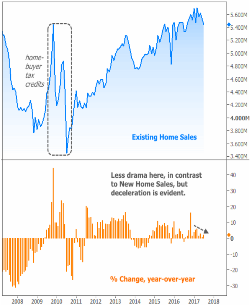
Existing Home Sales

On brighter notes for housing, both Black Knight and the Mortgage Bankers Association (MBA) noted significant milestones in foreclosure and delinquency metrics. In separate data the MBA noted ongoing resilience in mortgage applications, thanks in large part to lower rates helping drive refi demand.