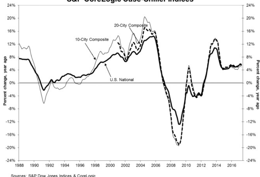
S&P CoreLogic Case-Shiller Indices

The month-over-month National Index gained 0.9 percent from March on a NSA basis compared to an 0.8 percent increase in March. It was up 0.2 percent after adjustment. The annual index was up 5.5 percent . The year-over-year increase in March was 5.6 percent, and that was revised down from 5.8 percent.