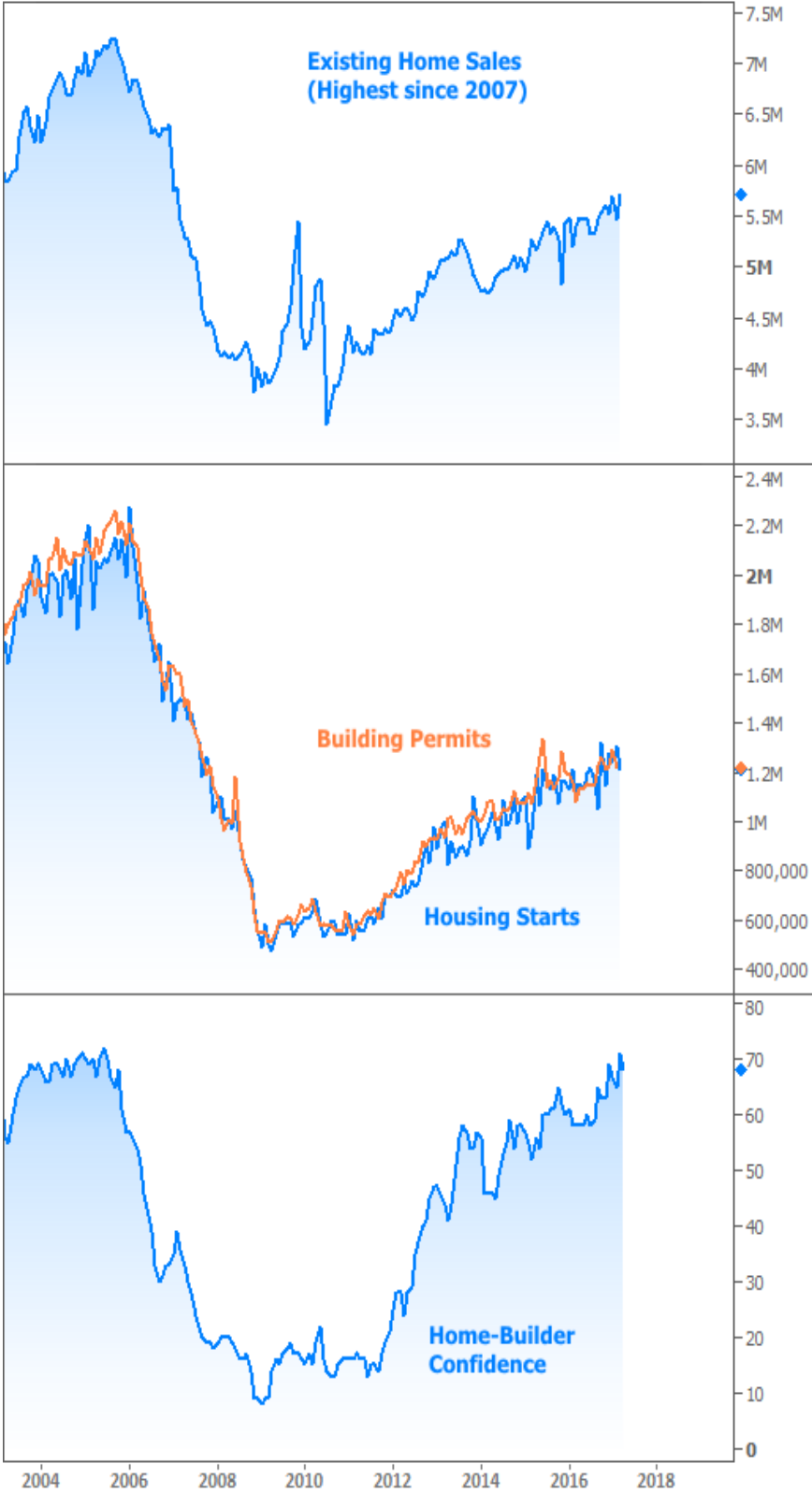
This Week's Housing Data

Subscribe to my newsletter online at: http://housingnewsletters.com/kevinlitwicki