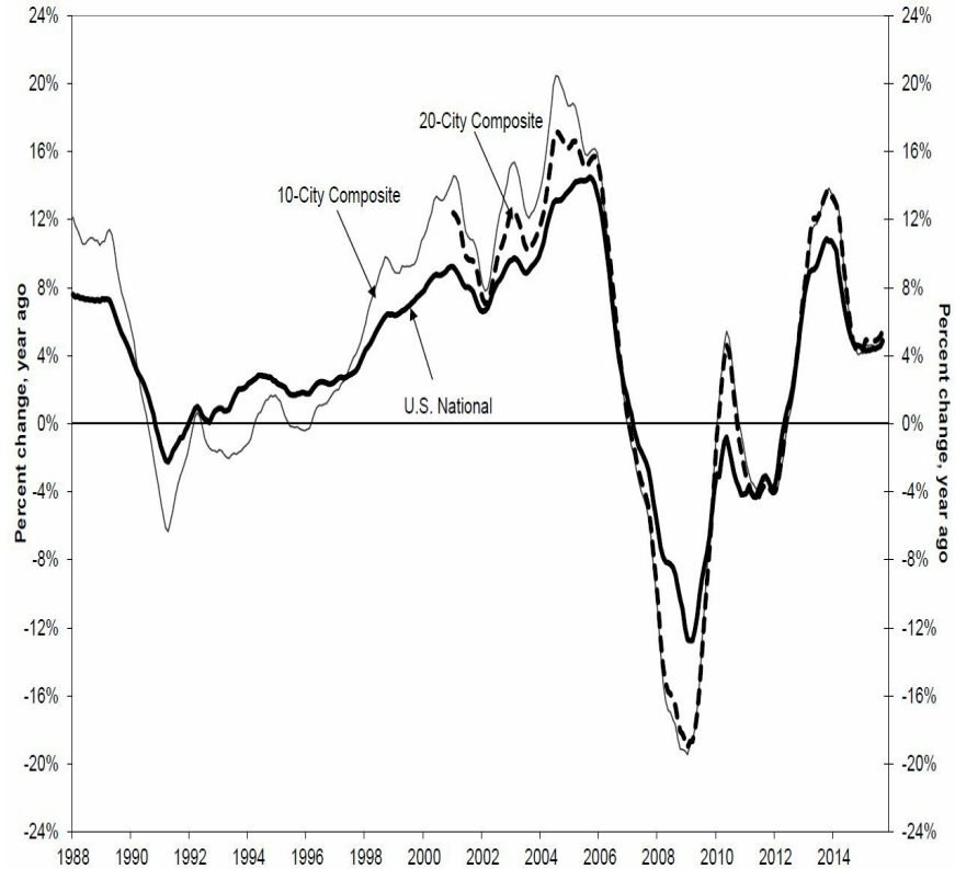
S&P/Case-Shiller Home Price Indices

Source: S&P Dow Jones Indices & CoreLogic