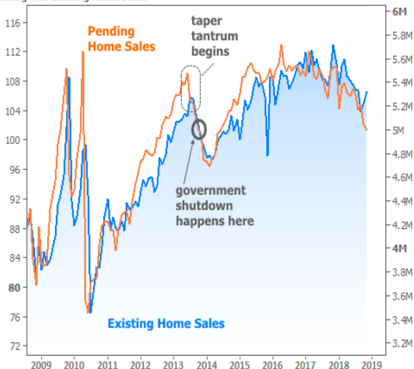
Pending and existing home sales

In the current case, things are a bit different. This time around the government shutdown hit during a fairly decent recovery in interest rates. It will give us a much better chance to see which one matters more. The only catch is that housing sales numbers for the time frame of the shutdown won't be out until later this month, and the most meaningful numbers won't be out until February or March.