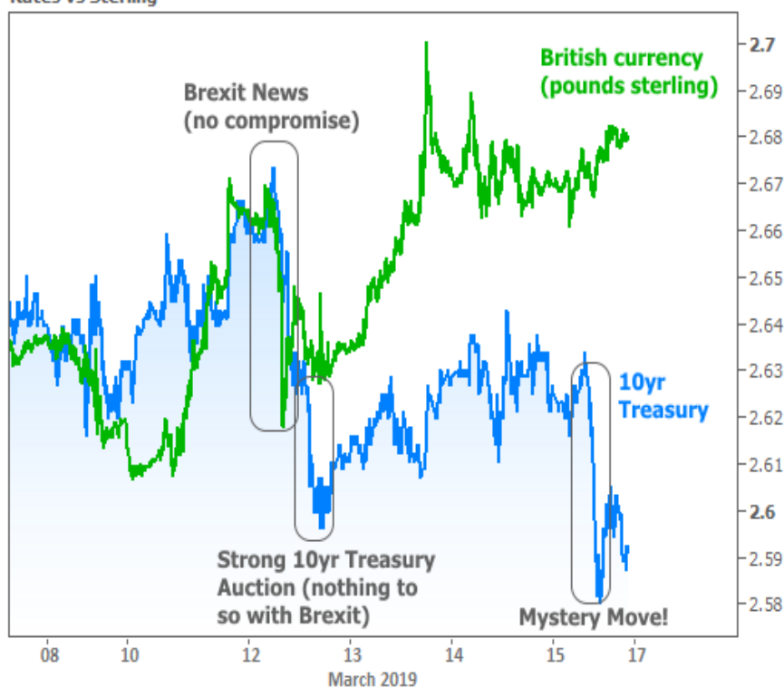
Rates vs Sterling

The 10yr auction was actually a revelation of sorts (circumstances suggested the auction could be tougher than normal). It carried bonds through the rest of the week with minimal damage, even as stocks and brexit sentiment argued for rates to move a bit higher.