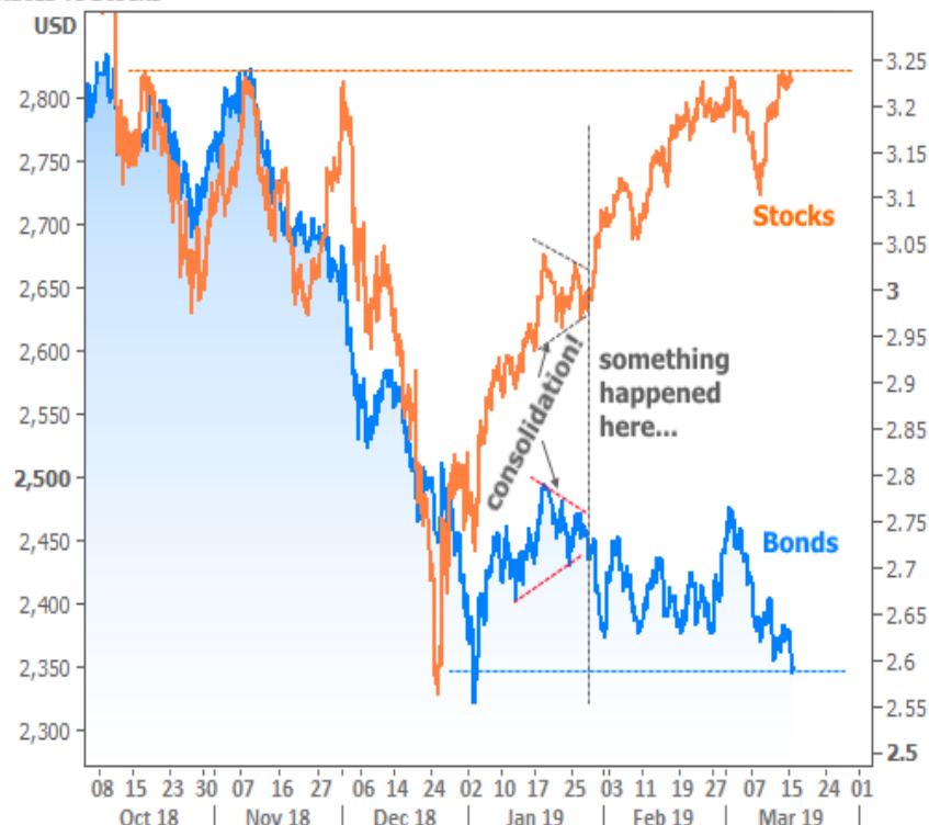
Rates vs Stocks

No, the Fed isn't getting ready to unveil another quantitative easing (QE) package, at least not directly. Indirectly, however, markets are about to feel the same sort of QE-driven euphoria. In fact, they've been feeling it for a few months now.