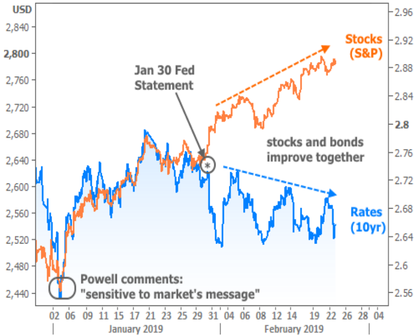
Rates vs Stocks

At the beginning of the year, Fed Chair Powell said the Fed is "sensitive to the message markets are sending." In other words, they recognized that they'd eventually need to do something if the stock market continued to plummet. At the time, Powell was happy to reaffirm that the Fed's bond portfolio would continue to shrink at regular intervals (i.e. no increase in bond buying on the horizon). The stock market was happy about the Fed implying slower rate hikes, but that wasn't big news for longer-term bonds (like 10yr Treasury yields and mortgage-backed bonds). Thus stocks and rates moved higher together in January.