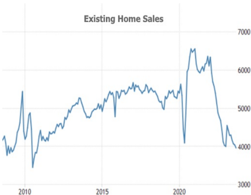
Existing Home Sales

TRADINGECONOMICS.COM | NATIONAL ASSOCIATION OF REALTORS