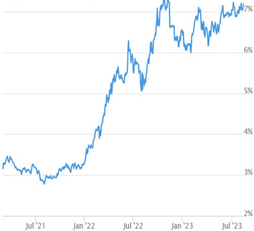
30yr fixed mortgage rate index

This is the new and persistent reality until one of 3 things happens: