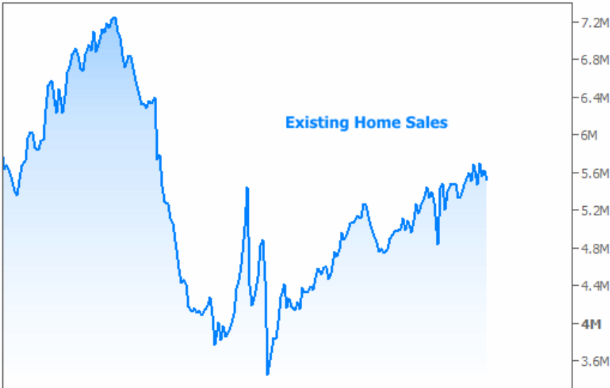
Existing Home Sales