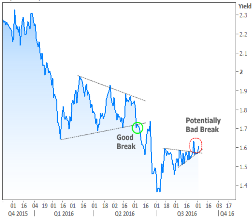
10yr Treasury Yield

Indeed, this has the potential to be the first sign of a bad break for rates, but there is at least one caveat . Financial markets tend to shed risk heading into weekends. This is doubly true for US markets heading into a 3-day weekend where the rest of the world will be trading on Monday. Shedding risk, in some cases, can mean that traders are selling bonds, thus causing rates to rise slightly more than they otherwise might be.