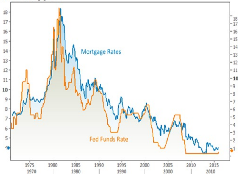
Fed Funds vs Mortgage Rates

What the chart DOESN'T show —at least not as obviously—are the subtleties that help brighten the outlook. First of all, notice the last Fed hike in 2004. At the time, mortgage rates actually moved slightly lower just after the Fed raised rates. The reasons for that are similar to the present-day reasons.