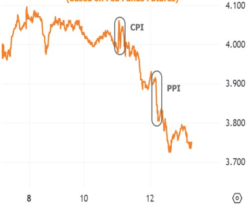
Fed Funds Rate Expectations, end of 2024 (based on Fed Funds Futures)

Mortgage rates don't correlate perfectly with Fed Funds Rate expectations (one reason we often advise that a Fed rate cut/hike doesn't mean a mortgage rate cut/hike). As such, they're not back below the recent lows, but they definitely haven't moved much higher. This week's gentle descent means we're continuing to hold a vast majority of the improvement seen in Nov/Dec.