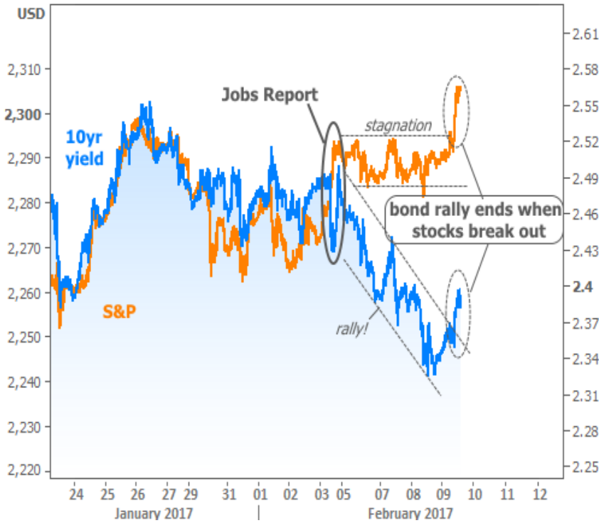
Stocks vs Bonds

Even though the previous chart highlights a potential connection between stocks and bonds, there are other, simpler ways to explain the recent movement. They go back to the notion of "waiting," and they're just as valid as any other explanation.