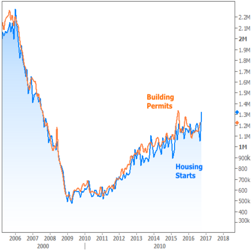
Housing Starts and Building Permits

Subscribe to my newsletter online at: http://housingnewsletters.com/sunquest