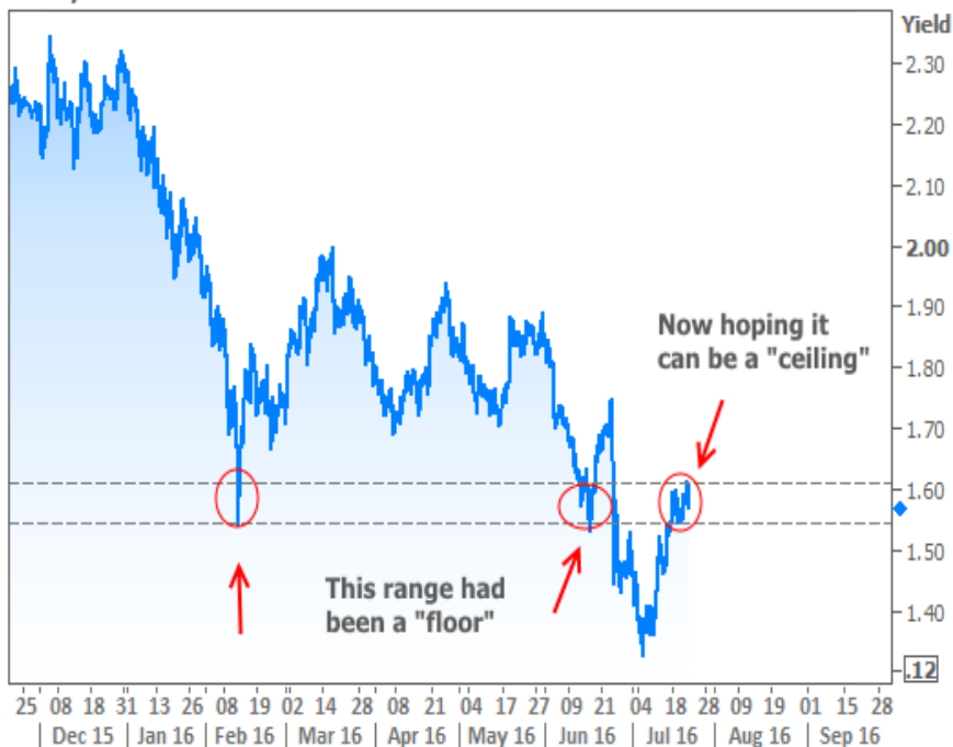
US 10yr Yield

If the battle with this ceiling isn't resolved before then, next week's events will probably help speed the process along. The headliners include announcements from the Fed and the Bank of Japan. The Fed is not expected to hike rates at this meeting, but they could drop hints, given ebbing panic surrounding the UK's vote to exit the EU, as well as the stronger jobs numbers earlier this month.