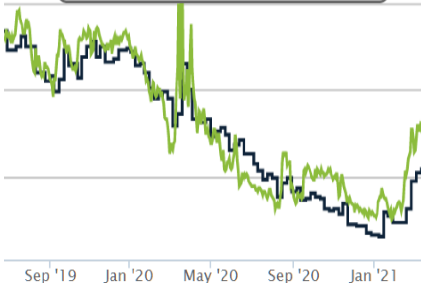
30yr Fixed Mortgage Rates — Freddie Mac Weekly Survey Rates (purchase) — Actual Daily Average Rates (Including Refis)

It's March 2021, and you'd now have to go back to March 2020 to see higher mortgage rates. It will take mainstream media a while to get caught up with this new reality because the most widely cited mortgage rate survey tends to lag behind sharp moves like this.