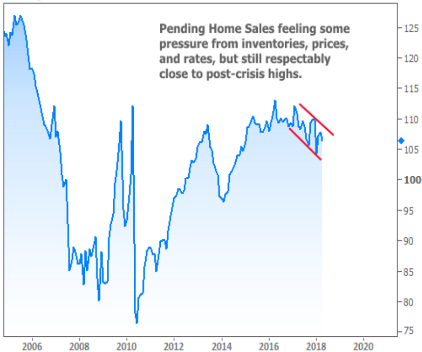
Pending Home Sales

Subscribe to my newsletter online at: http://housingnewsletters.com/stephenmoye