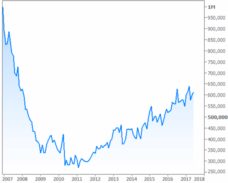
New Home Sales