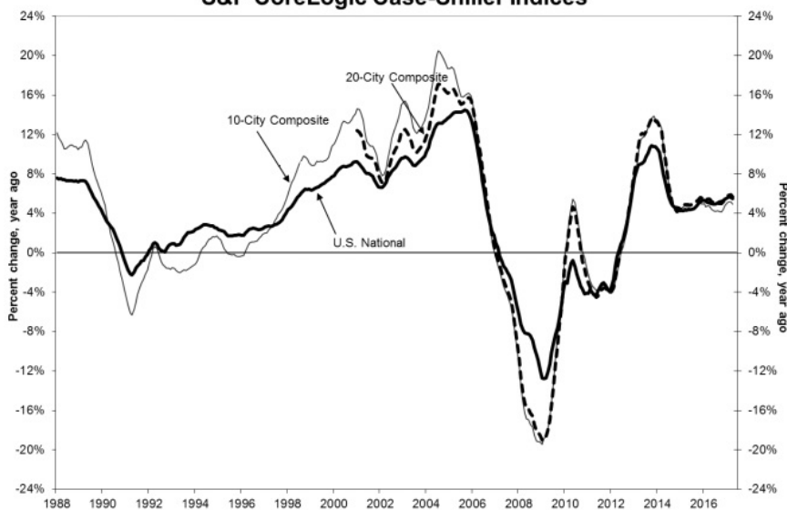
S&P CoreLogic Case-Shiller Indices

Sources: S&P Dow Jones Indices & CoreLogic