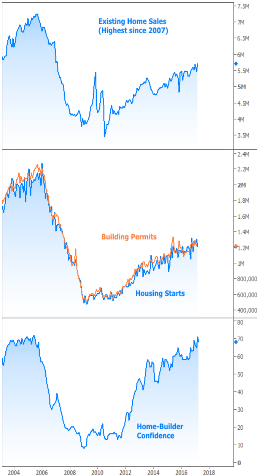
This Week's Housing Data