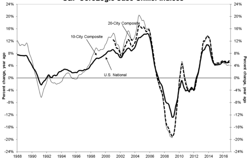
S&P CoreLogic Case-Shiller Indices

Sources: S&P Dow Jones Indices & CoreLogic