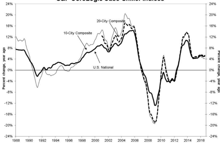
S&P CoreLogic Case-Shiller Indices

Sources: S&P Dow Jones Indices & CoreLogic