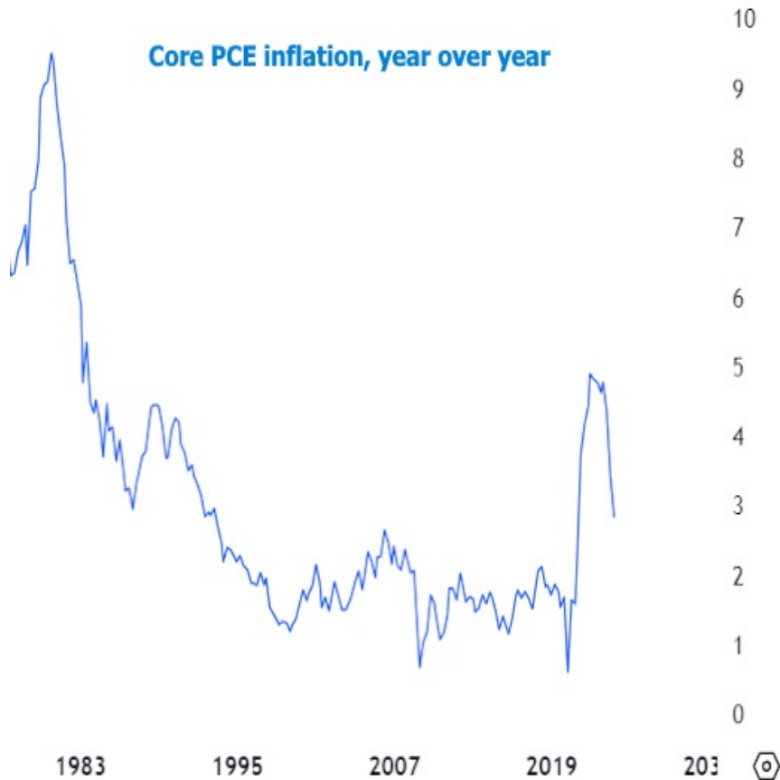
Core PCE inflation, year over year

While it's no longer necessarily a top priority, the Fed would also not mind seeing some more slack in the labor market and some other signs of economic weakness to bolster the case for further disinflation. If the economy is too strong, they need to wonder if inflation might pick back up.