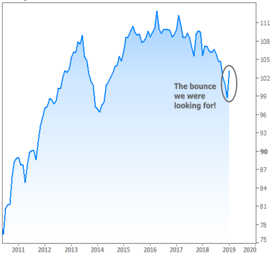
Pending Home Sales

As of Wednesday, we finally got the Pending Home Sales report showing the bounce we were looking for. Pending Sales momentum is a precursor for a bounce in the next round of Existing Home Sales data. That means we may indeed have seen a cyclical low with the last report.