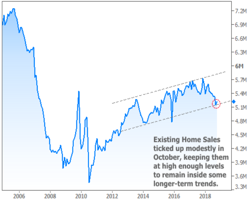
Existing Home Sales

Existing Home Sales have fallen a bit more noticeably in 2018, but by bouncing here, they would be able to maintain a longer-term uptrend that began roughly 5 years ago.