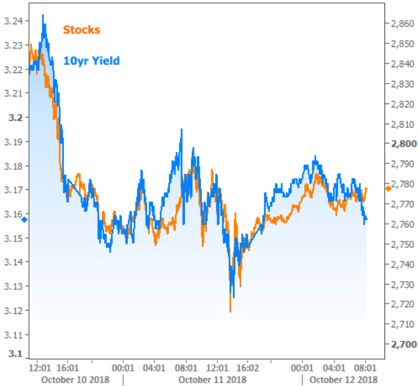
stocks vs bonds

Subscribe to my newsletter online at: http://housingnewsletters.com/stephenmoye