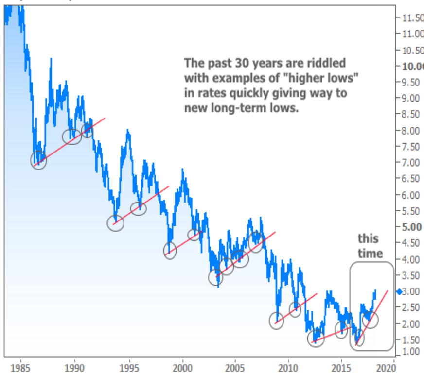
10yr Treasury Yield

The previous chart isn't offered as proof that rates will soon be moving lower . Rather, it's proof that rates don't necessarily HAVE TO go higher .