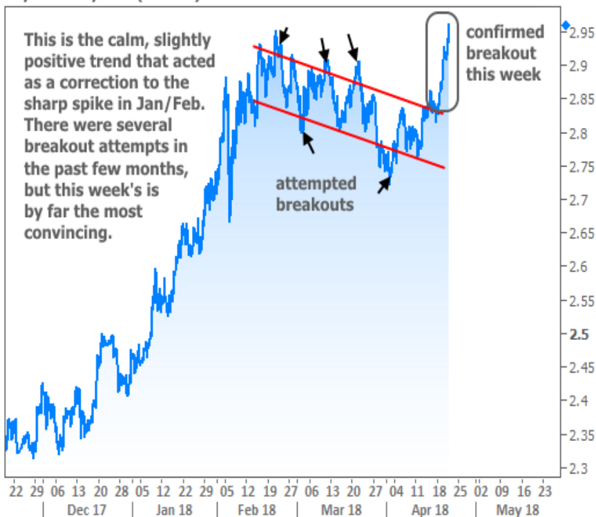
10yr Treasury Yield ("Rates")

This old wolf not only gets a bad rap, but he also gets more credit than he deserves . Rate spikes like this are simultaneously feared as a negative indicator for housing and blamed for spooking the stock market. A housing hit seems logical enough. After all, rates affect affordability. But in reality, none of the ups and downs in rates over the past few years have had commensurate impacts on housing numbers.