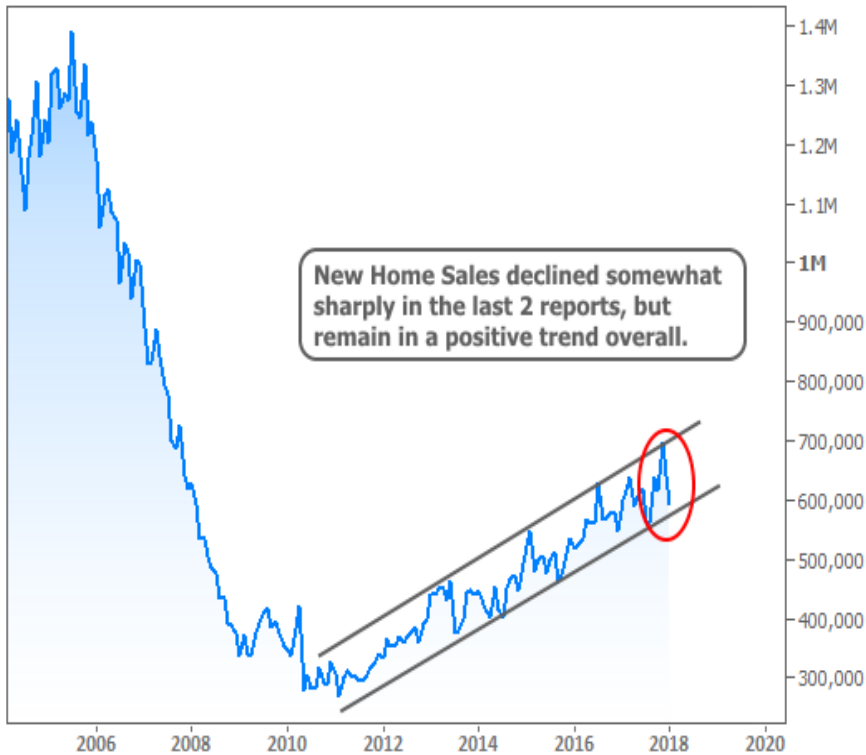
New Home Sales

Of course rates are far from the only input for home sales. As we discussed last week, inventory is an ongoing problem, as is affordability. The tariff news creates more uncertainty on that front. Tariffs could increase building costs and hinder the construction of affordable homes, according to Lawrence Yun, chief economist of the National Association of Realtors.