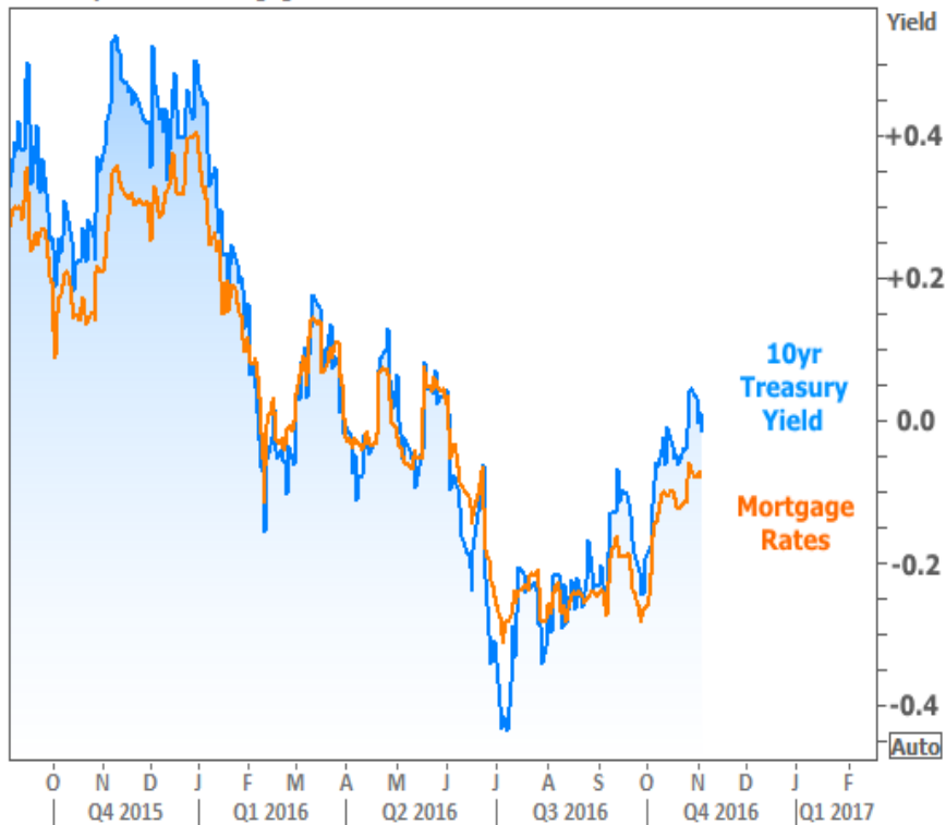
Treasury Rates vs Mortgage Rates

Bottom line: for any given amount of interest rate drama in the news, mortgage rates have been fairly well insulated. That will continue to be the case unless the moves get much bigger, and again, we're probably waiting until early December to find out if that will be the case.