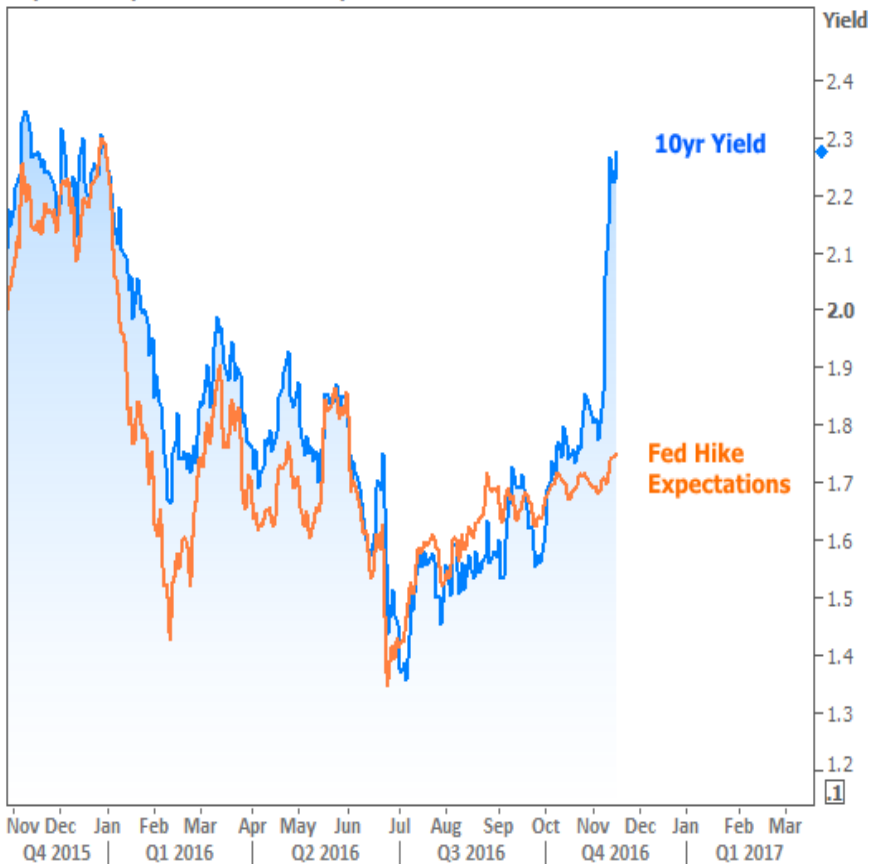
10yr Treasury Yield vs Rate Hike Expectations

If not Fed fears, then what other insidious enemy has bond markets so scared? There are actually several . These include any number of the following (in order of importance and apparent level of certainty):