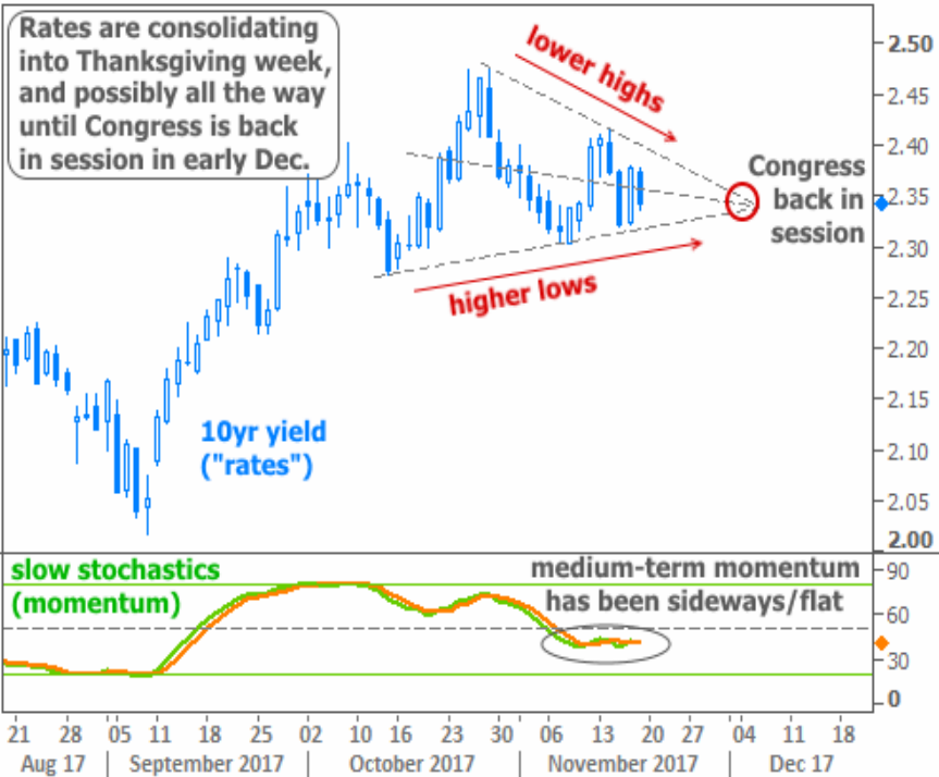
US 10yr Treasury Yield

In the spirit of "waiting and seeing," interest rates improved slightly this week. This keeps them locked in a consolidative trend (higher lows and lower highs) that's been underway for more than a month. It's the bond market's way of expressing indecision, and for now, the trend suggests indecision could linger at least through early December. Even if we apply some esoteric math to recent rate movement and derive a line that measures momentum, that line has been almost perfectly flat for several weeks.