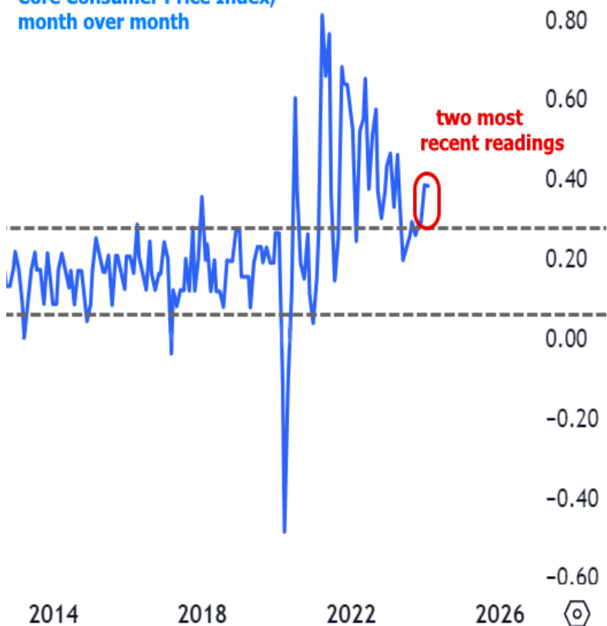
Core Consumer Price Index, month over month

The news wasn't quite as bad from the week's other key inflation report, but it certainly didn't help. The Producer Price Index (PPI), which measures wholesale inflation, has also now seen the highest two consecutive months since inflation first began to calm down in 2022.