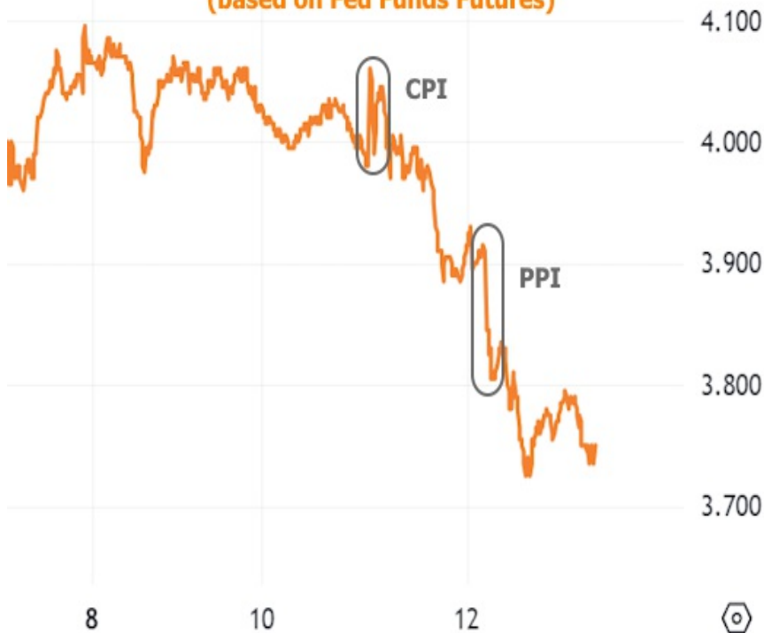
Fed Funds Rate Expectations, end of 2024 (based on Fed Funds Futures)

Mortgage rates don't correlate perfectly with Fed Funds Rate expectations (one reason we often advise that a Fed rate cut/hike doesn't mean a mortgage rate cut/hike). As such, they're not back below the recent lows, but they definitely haven't moved much higher. This week's gentle descent means we're continuing to hold a vast majority of the improvement seen in Nov/Dec.