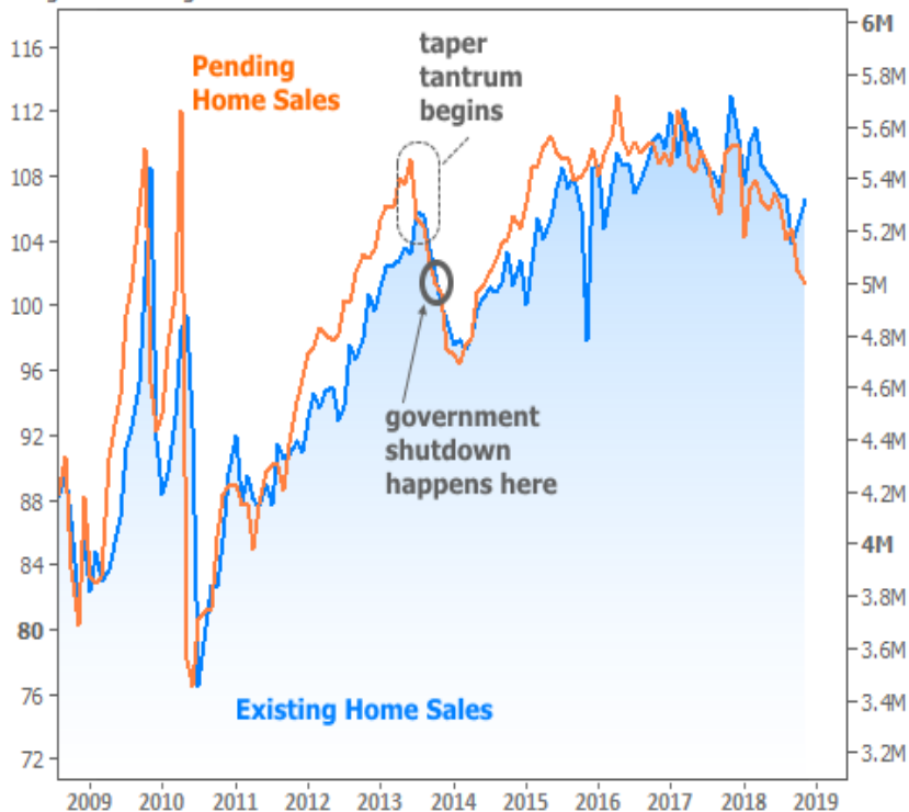
Pending and existing home sales

In the current case, things are a bit different. This time around the government shutdown hit during a fairly decent recovery in interest rates. It will give us a much better chance to see which one matters more. The only catch is that housing sales numbers for the time frame of the shutdown won't be out until later this month, and the most meaningful numbers won't be out until February or March.