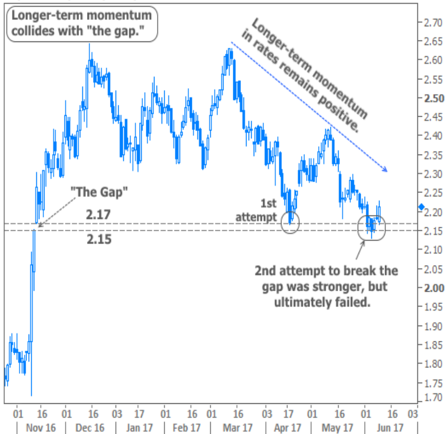
10yr Treasury Yield (Rates)

These sorts of gaps can be significant lines in the sand for investors. This particular gap corresponds to average mortgage rates near 4.0%. As such, 10yr yields will need to break well below 2.15% if we're to see widespread availability of conventional 30yr fixed rates in the high 3 percent range.