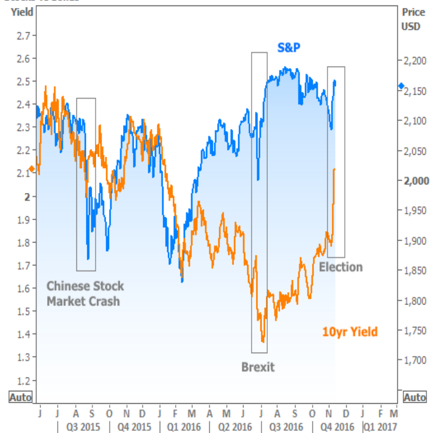
Stocks vs Bonds

By a decisive margin, the last 2 days of this week were the worst 2 days for rates since the taper tantrum in June 2013. The existing uptrend in rates was completely shattered, and history suggests there's still a chance of more pain ahead.