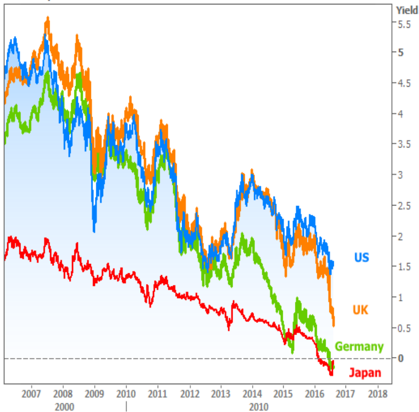
Global 10yr Bond Yields

It's this big picture correlation--this global race to the lowest rates--that drives the long term trend lower. Short term trends toward higher rates are merely a necessary byproduct of the larger-scale downtrend. Sometimes, these moves higher in rates will line up with moves higher in oil and stocks, but it's central banks that will ultimately set the tone.