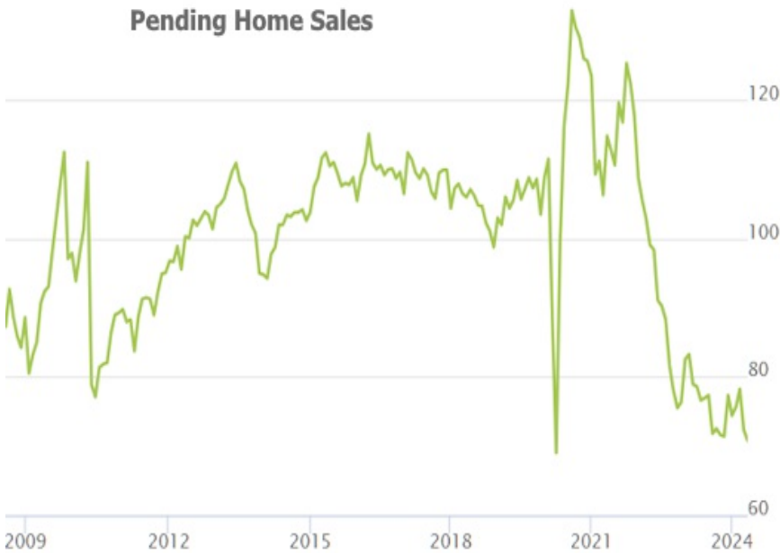
Pending Home Sales

Sales of new homes are also near their recent lows, but remain much higher relative to pre-pandemic levels.