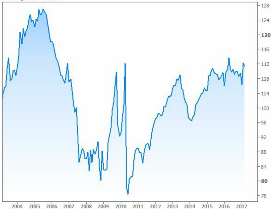
Pending Home Sales

The downturn was not unexpected . Pending home sales have moved up and down regularly in recent months, pretty accurately predicting, as they are designed to do, the see-saw behavior of existing home sales. Econoday's poll of analysts came up with a consensus of a -0.5 percent decline after February's 5.5 percent increase. Predictions ranged from -1.2 percent to