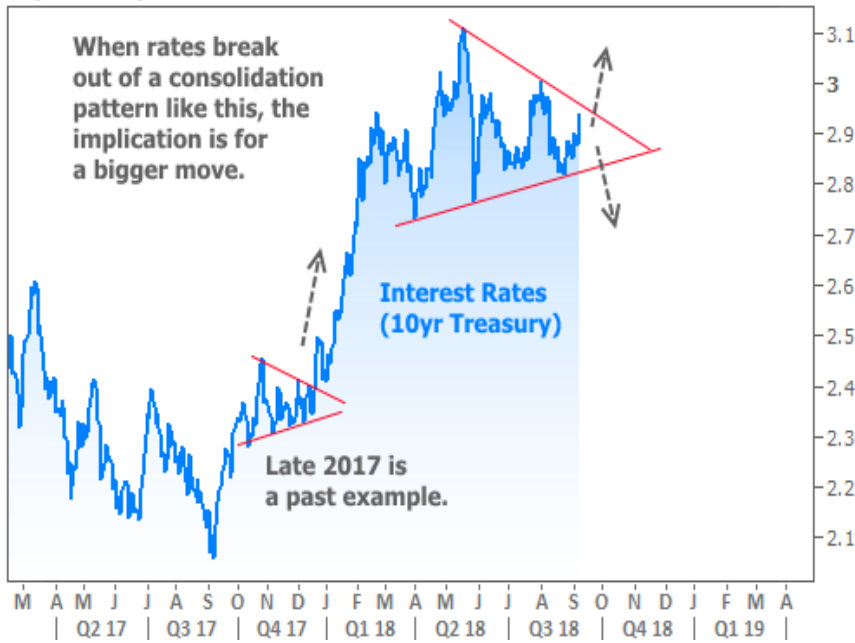
10yr Treasury Yield

Subscribe to my newsletter online at: http://housingnewsletters.com/richhomeloans