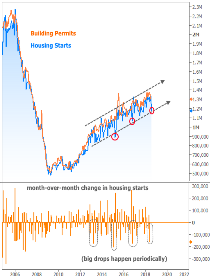
Starts vs Permits

Big drops in housing starts happen from time to time. And despite this particular drop, a positive trend remains intact.