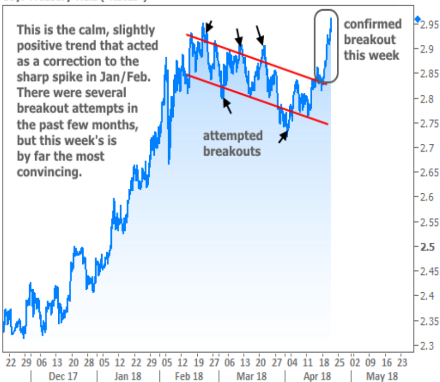
10yr Treasury Yield ("Rates")

This old wolf not only gets a bad rap, but he also gets more credit than he deserves . Rate spikes like this are simultaneously feared as a negative indicator for housing and blamed for spooking the stock market. A housing hit seems logical enough. After all, rates affect affordability. But in reality, none of the ups and downs in rates over the past few years have had commensurate impacts on housing numbers.